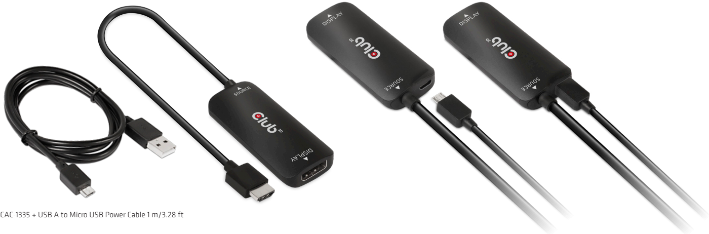
CAC-1335 + USB A to Micro USB Power Cable 1 m/3.28 ft

** Connect a power adapter or computer to the USB Type A plug to supply power for the adapter. Please check whether your external power source supports 5V / 1.5A (7.5W).